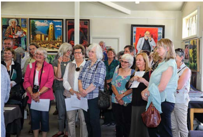
Opening of Exhibition

The Gallery will be open daily from 10.00am to 1.00pm.