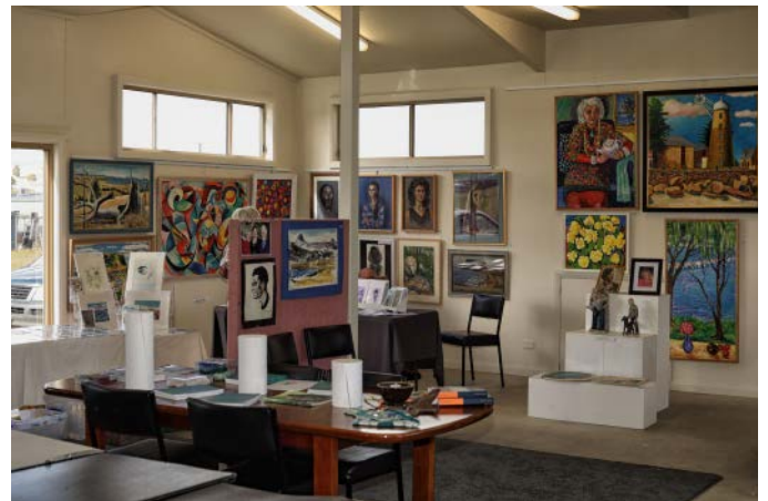
Works on display