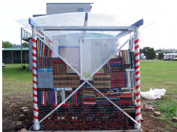
Cubby House in Progress